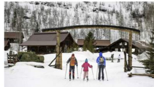
Skiing Vista Verde. (Eileen Ogintz)